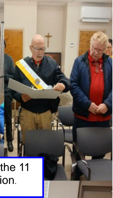
Exemplification February 1st after the 11 am Mass And Corporate Communion.